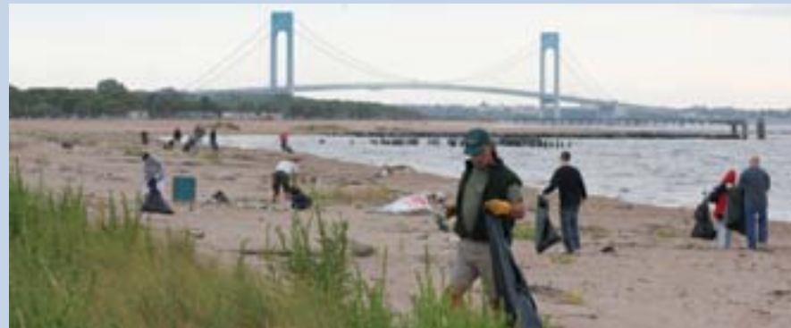
FCA BEACH CLEAN UPS WERE A BIG HIT THIS YEAR, AND WE REMOVED LITERALLY TONS OF DEBRIS.