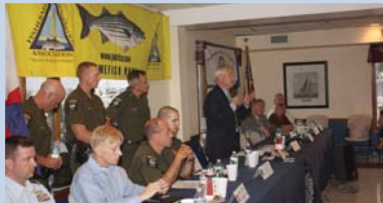
CONGRESSMAN MCMAHON ADDRESSES OUR THIRD BOATERS AWARENESS MEETING WITH REPRESENTATIVES FROM NYS DEC, NJ MARINE POLICE, US COAST GUARD, US ARMY CORPS OF ENGINEERS, US POWER SQUADRON AND SANDY HOOK PILOTS.

Parents and children participate in educational fishing games at the New Jersey Outdoor Boat Sale & Expo at Blue Claw Stadium in Lakewood NJ. The FCA along with the Fisherman Magazine set up tables of marine attractions at the Children's Cove.