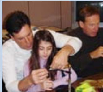
ABOVE, A YOUNG ANGLER LEARNS THE INTRICACIES OF THE ART OF FLY TYING.

paid staff, and is supported entirely by the generosity of its sponsors