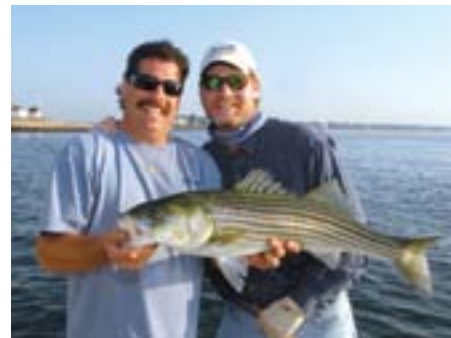
CHAIRMAN CRESCITELLI FISHING WITH BASEBALL HALL OF FAME WADE BOGGS