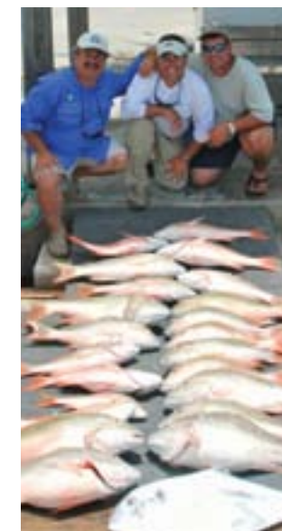
"WHAT A CATCH!" BILL AND SCOTT PACIELLO, AND JOE BLANDA ON RECENT KEY WEST TRIP.

Key West is unique from the other keys, having its own culture where the local dub themselves "Conchs" and the local government takes pride in being known as the "Conch Republic." Key West has something for everyone- unlimited fishing opportunities to fit every type of budget, basic hotels to five star, restaurants from local seafood to some of the best Cuban cuisine (don't forget your only 90 miles to Cuba), plenty of shopping along the famed Duval Street, to great sunset celebrations along Malory Square. If you enjoy a little or a lot of nightlife Key West has plenty of options from live music daily at Capt. Tony's Saloon to Sloppy Joe's to Schooner Wharf. And don't even think about heading home without trying a piece of Key Lime pie!