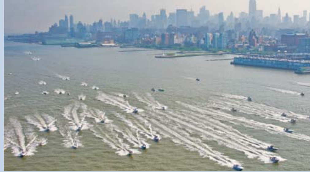
ABOVE, PARTICIPANTS OF THE 2010 FCA MANHATTAN CUP STREAK SOUTH ALONG THE HUDSON RIVER WITH HIGH HOPES OF CATCHING A BIG STRIPED BASS.